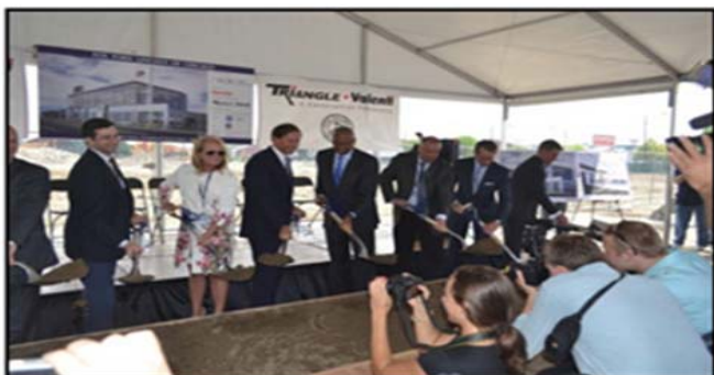
Fox Motors Ground Breaking Ceremony, 2014